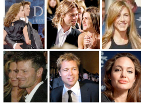
Fig. 2. Example of what the page of photos looked like for the “photo page” prompts.

In the second year of our study, we recorded and annotated 66 ASL passages from 3 signers (approximately 75 minutes of data). As was done in year 1 of the project, we used a set of prompts to elicit unscripted multi-sentential single-signer passages. The prompts used in year 2 are listed in Table 1. As was done in year 1 of the project, our team of ASL linguistics experts analyzed the stores collected to produce a timeline of each performance that includes the sequence of signs, the establishment of SRPs, the references to SRPs, the use of CPs, and other linguistic phenomena of interest to our research. In order to evaluate the set of prompts used during year 2 of our project, we calculated the average passage length (measured in the number of signs performed or the number of seconds); the results are shown in Fig. 3. We would prefer longer stories in our corpus because this increases the opportunity for the signer to establish several SRPs and to refer to them again. Further, we have found it easy to record very short stories from signers during our recording sessions; finding prompts that encourage a signer to perform a longer multi-sentence passage are therefore valuable to identify. Note: Error bars in Figures 3, 4, 5, and 6 indicate the standard error of the mean for each value.