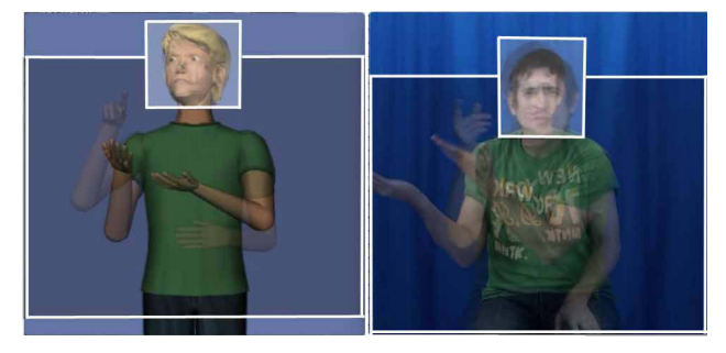
Fig. 3: Screen regions for the face and hands AOIs of the animated character and the human signer.